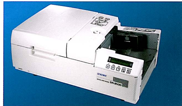
SR-3500 (Main body)

OMR reader is preferred in many applications over contact image scanners due to high speed and better accuracy.