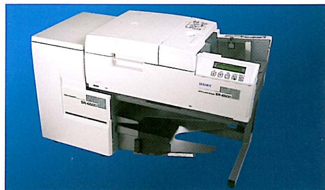
SR-6500 (Main body + Select Stacker)

Performance (saving time ---reduce the cost)